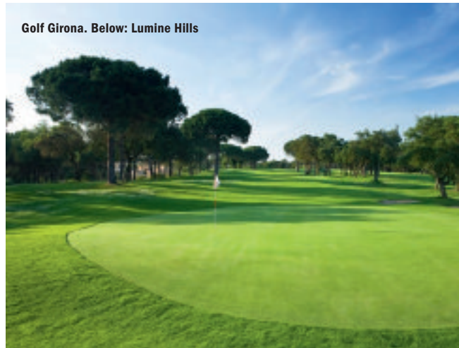
Golf Girona. Below: Lumine Hills