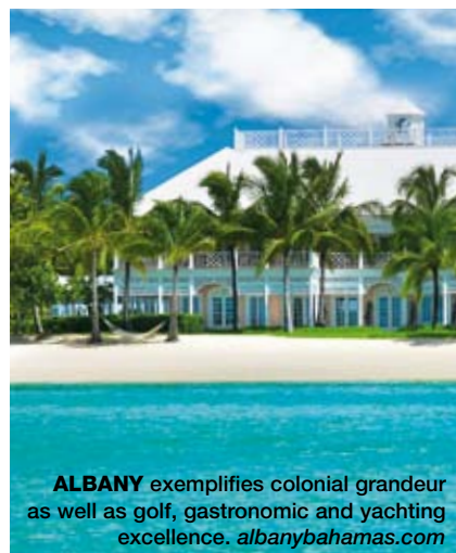
ALBANY exemplifies colonial grandeur as well as golf, gastronomic and yachting excellence. albanybahamas.com

After the Mediterranean, where 60% of the larger pleasure vessels are based, the Caribbean is the superyacht sanctuary of choice, with a number of ambitious new marina developments on the slipway. Raising the bar on New Providence in the Bahamas, Albany is the billion-dollar brainchild of British entrepreneur Joe Lewis, with partners Ernie Els and Tiger Woods. When the 71 slips ranging in size from 15 to 73 metres are complete, there is every chance the yacht Privacy , belonging to the world's most famous golfer, will make an appearance. The 235ha gated community, with championship golf course, boutique hotel, equestrian centre and spa, will eventually have 350 homes, of which the most aesthetically arresting are being built dockside. The 100 Marina Residences, priced from $4 million to $40 million and designed by some of the world's foremost architects, will range from two-bedroom units to five-bedroom penthouses, with both proximity to Nassau airport and the benign Bahamas