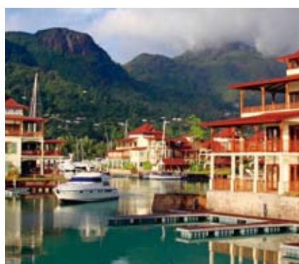
CHRISTOPHE HARBOUR (top) Cutting through a sand bar has created a stunning natural deepwater basin in St Kitts. christopheharbour.com