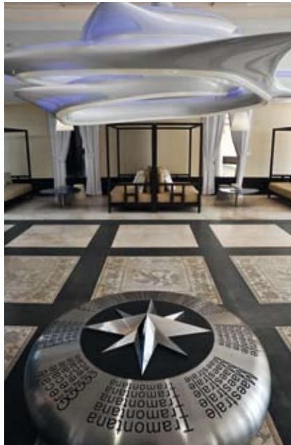
LA MADDALENA , a divine Sardinian location with lashings of Italian design flair. lamaddalena.hyc.com

The Asia Pacific region is also witnessing a flowering of oceanside creativity. Absurdly close to paradise,