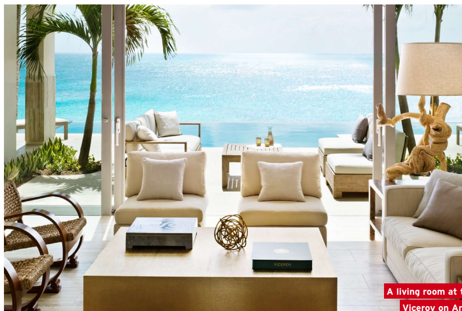
A living room at the Viceroy on Anguilla