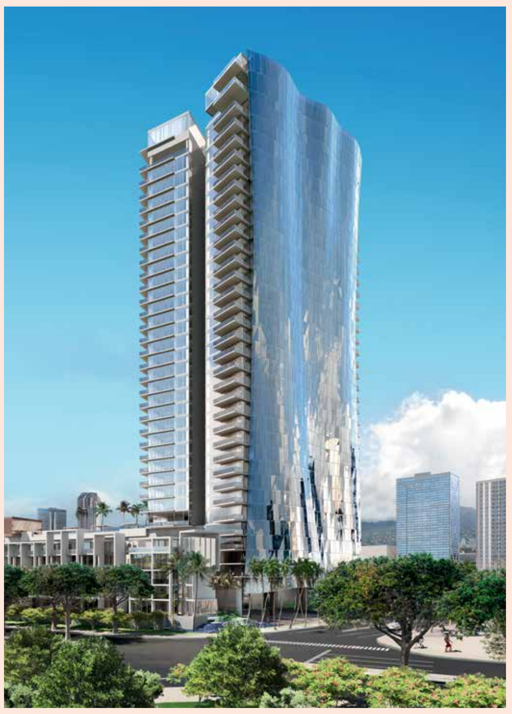
Hawaii's Waiea Tower will feature one of the Aloha State's most prized properties