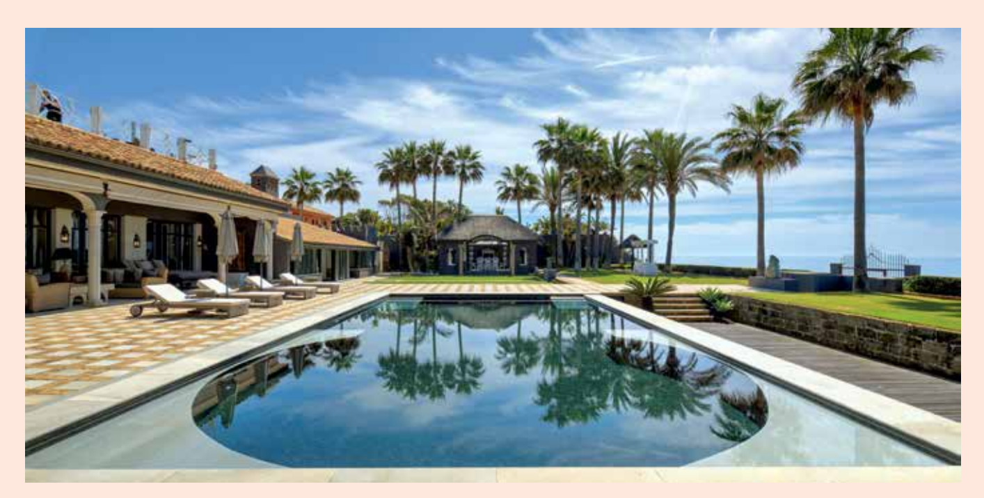
The palm-lined pool at El Rosario, Marbella – a villa that adds a raft of first-class amenities to its prime location