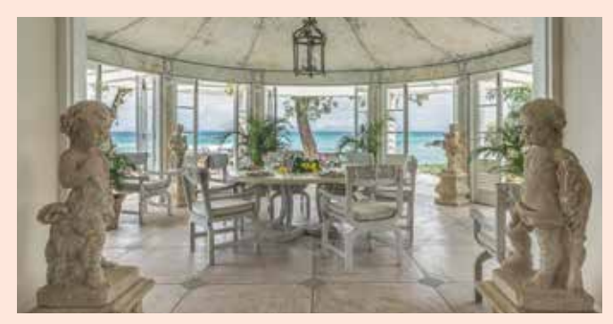
Ocean views from Seastar's dining room on Mustique

Powered by its own solar farm with generator backup, plus underground filtration and rain-catchment systems, the entire family compound, a two-hour drive from Cancún airport, is self-sufficient, and - thanks to 25 cameras - very secure. Hacienda Palancar has the warm, cobalt Caribbean to its east and the sweet water Capechen Lagoon to the west, and when relaxing under the palapa on the private dock, \rightarrow