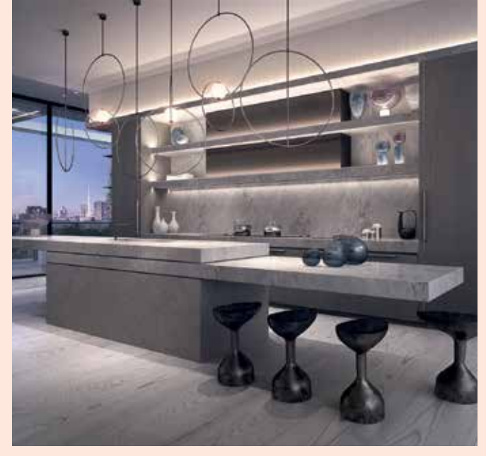
The marble kitchen of the Grand Pavilion Penthouse, Eastbourne, Melbourne

Jeffrey Copolov of Bates Smart, designer of the Eastbourne, Melbourne