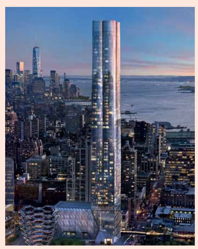
15 Hudsons Yard at the heart of one of the Big Apple's largest developments

Nearby culinary excellence - in the shape of the two-Michelin-starred Palme d'Or down on La Croisette - is also on the menu for prospective purchasers of the penthouse at 87 Soligny in Cannes. Not all such apartments need sit astride towering skyscrapers – this Côte d'Azur block is only four storeys high with just nine apartments, but "on top" is still the place to be. The large five-bedroom residence has a spacious open-plan living room and kitchen leading up a stunning glass interior staircase to a handsome 323sq m rooftop terrace with views of the Mediterranean from the private pool. Elevation, capacious accommodation and the stars above: penthouses are the supreme city centre trophy homes.