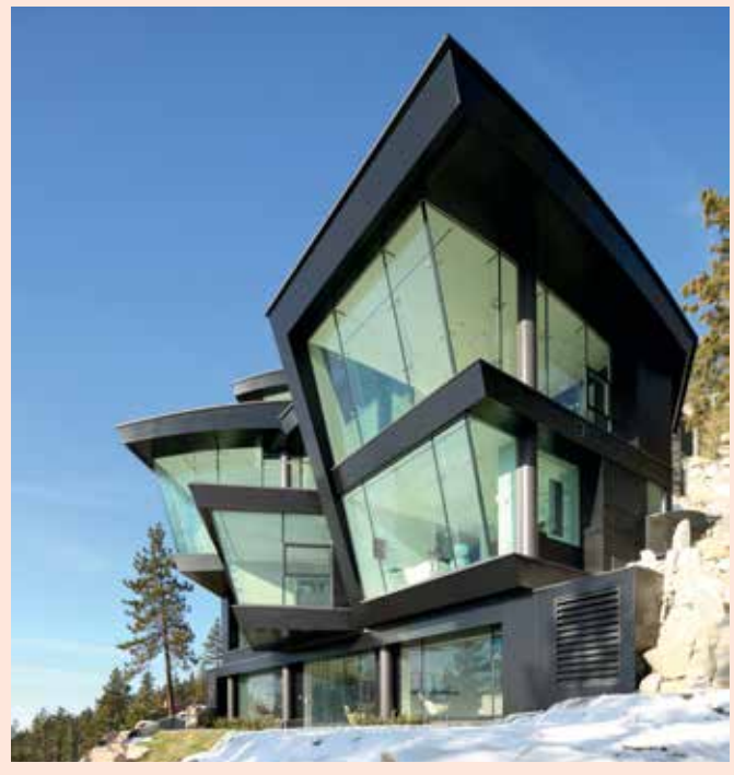
The angular glass-and-steel structure at 580 Gonowabie, Lake Tahoe

Finally, to the Japanese Alps, or to be more precise the Wadano area, Hakuba's premier ski district at the foot of the Nakiyama slopes.