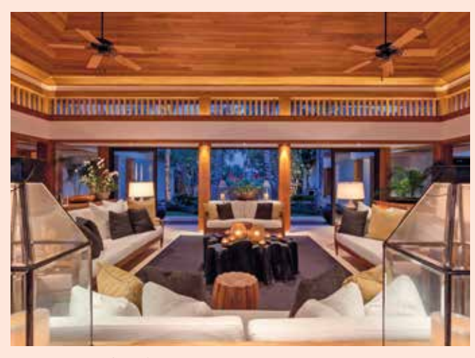
The airy lounge of Villa Nandana, near Phuket

Finally, back to the Caribbean, the spiritual home of sandy-foot chic. Mustique in Saint Vincent and the Grenadines has enjoyed celebrity status for 60 years,