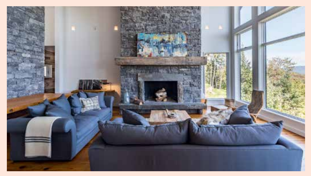
Rugged House in Mont-Tremblant, Quebec, is an aptly named haven in a rocky climate

As a multi-generational lifestyle buy, and an investment with substantial rental potential, a wellequipped mountain retreat is the pinnacle for many discerning homebuyers. •