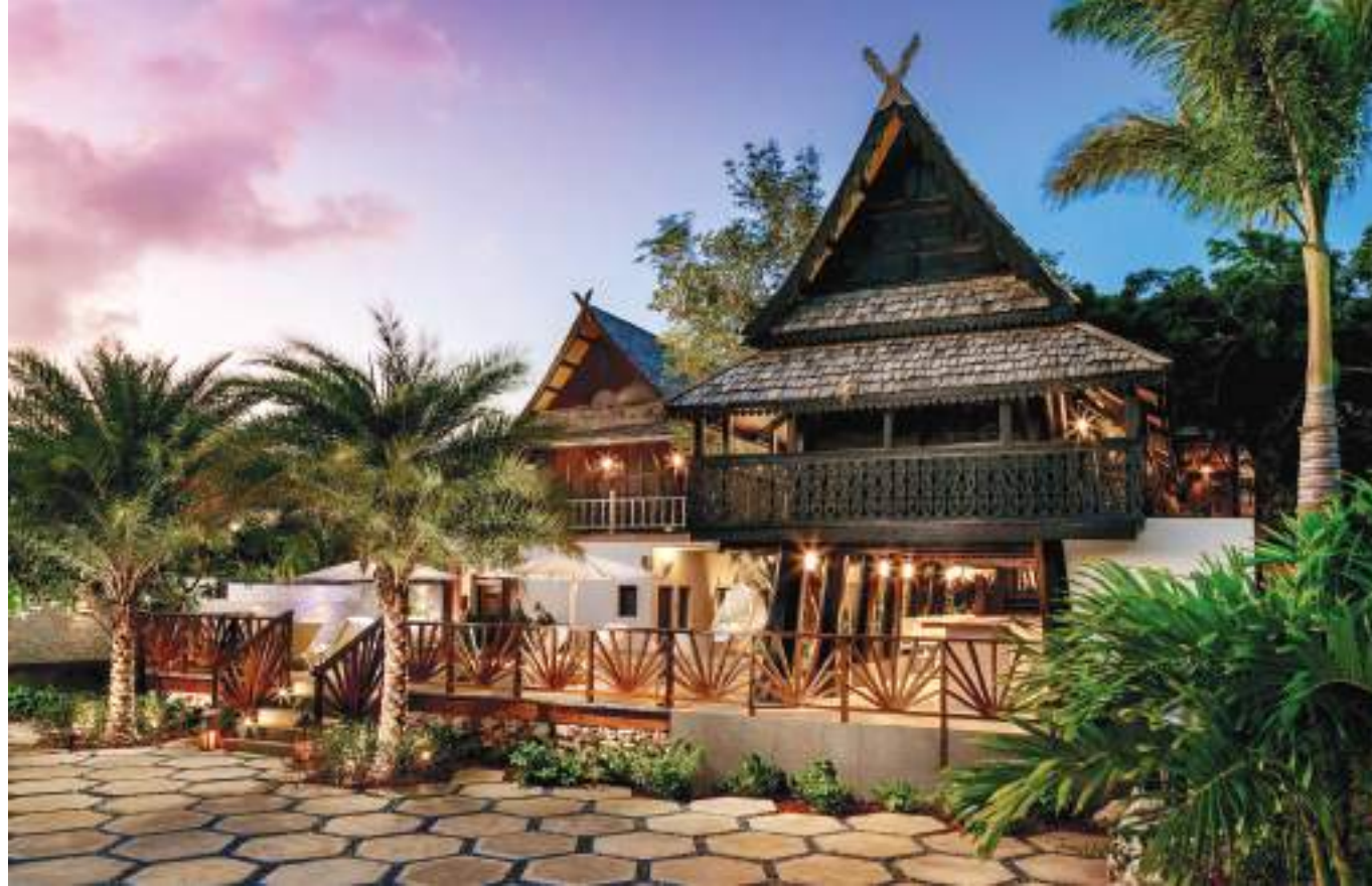
LEFT Thai House Spa at Zemi Beach