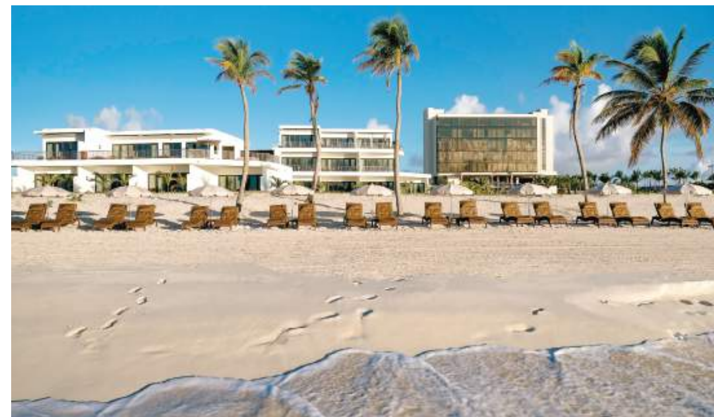
FAR LEFT Shoal Bay East from the Manoah