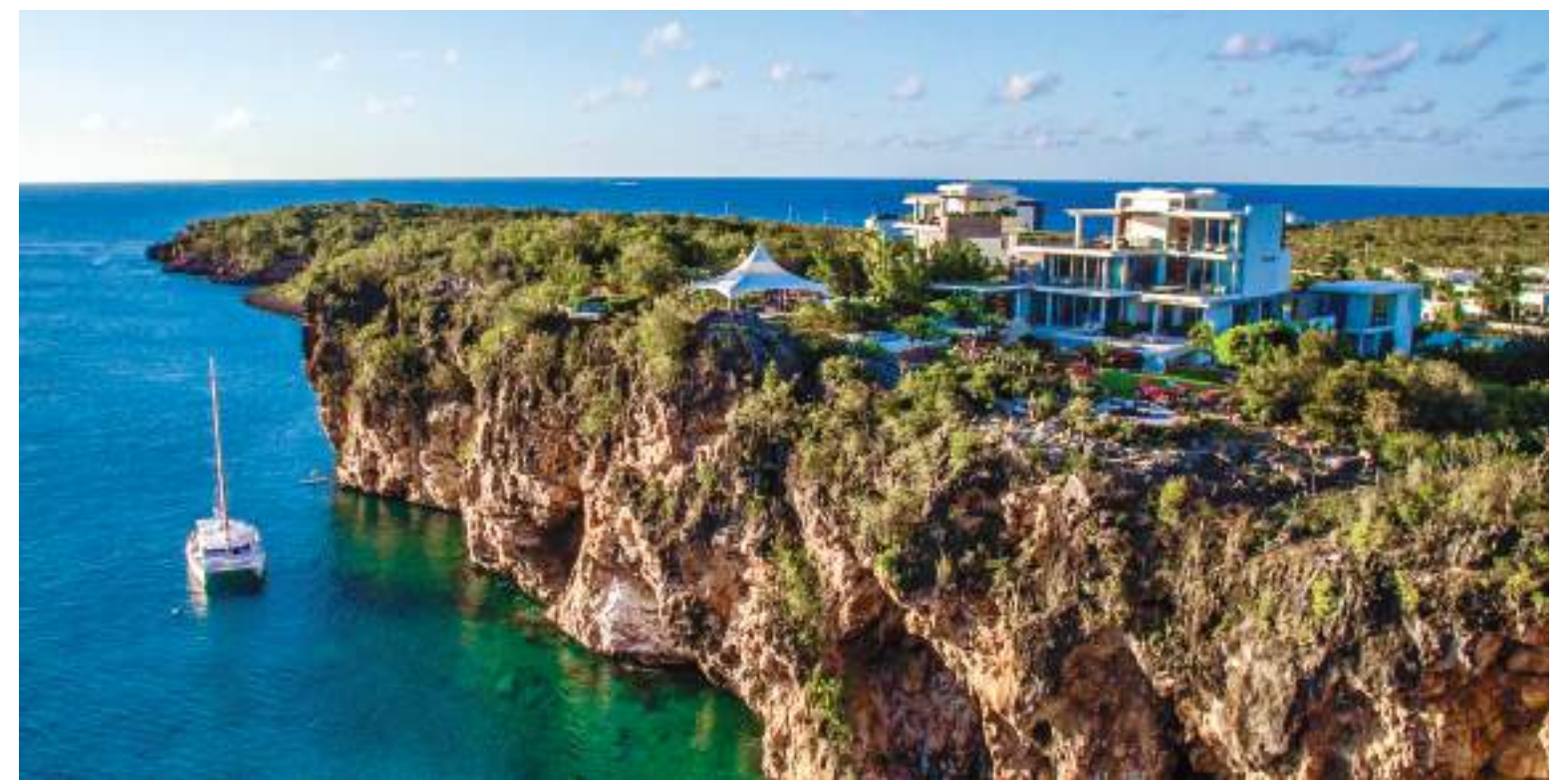
TOP Modish minimalism at the Beach House ABOVE The Beach House's laid-back living room TOP RIGHT Santosha sits on Long Bay RIGHT FAR MIDDLE Colonial grandeur at Santosha RIGHT MIDDLE Super contemporary Ani Villas RIGHT Ani Villas offers cliff-top seclusion

Staying on the beatific Meads Bay, the eight-suite Beach House epitomises the private villa rental scene that makes the island so appealing to Hollywood A-listers. Having just been revamped, this ultra-modern beachside residence is all glass, petrified wood and white horizontals; add an elegant home theatre, tennis court, infinity pool and games room, plus spacious indoor and outdoor entertaining spaces, all discreetly serviced by fulltime staff, and this must now be one of the best-appointed villas in the whole region.