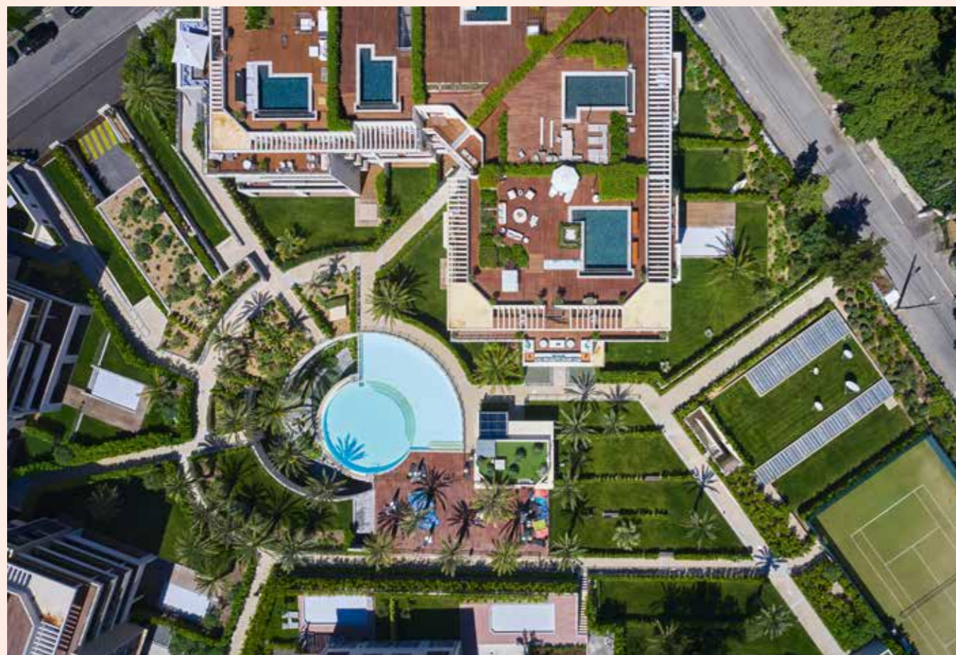
The central gardens of the Parc du Cap buildings in Antibes are just one feature of residences that radiate Côte d'Azur chic

it's the immaculate quality of amenities, headlined by Aman's consummate concierge service, a three-floor spa and subterranean jazz club that distinguishes this from similar Gothamite projects.