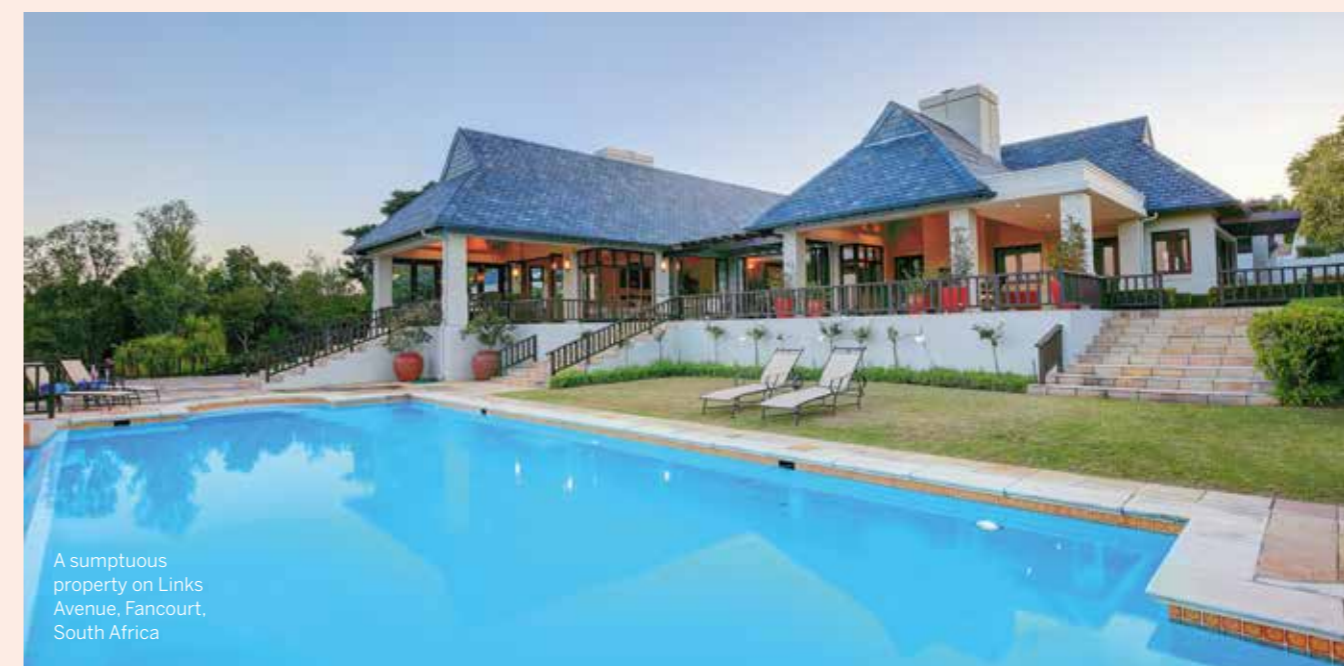
A sumptuous property on Links Avenue, Fancourt, South Africa

The golf development book was written in the 1970s by Kiawah Island ( kiawahisland.com )