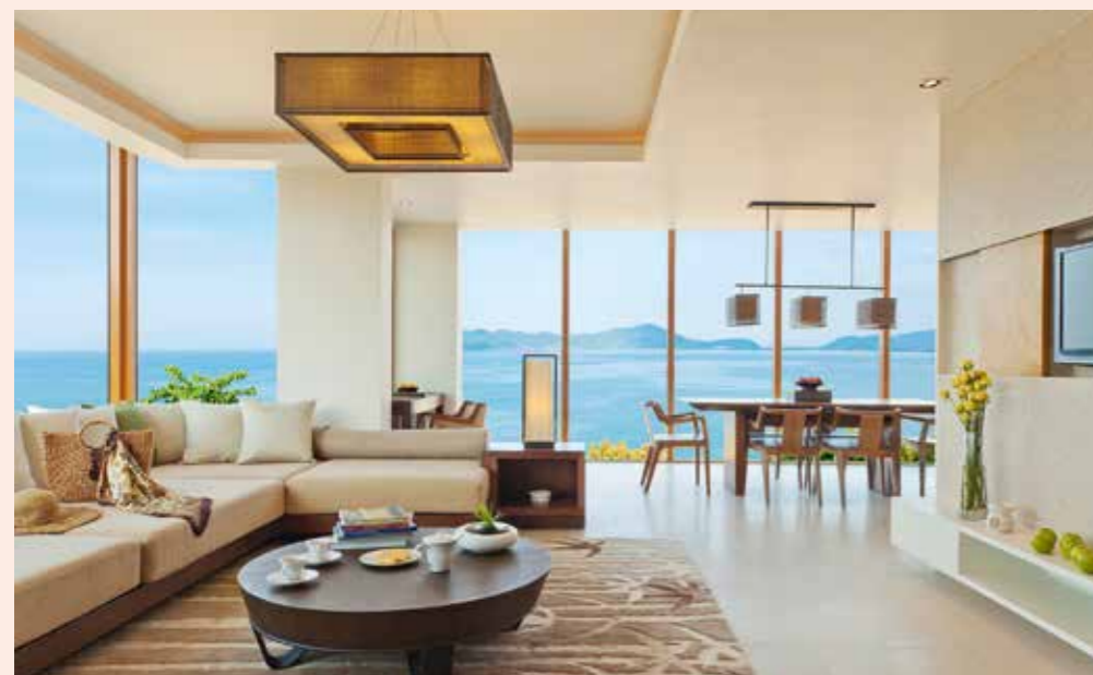
A Banyan Tree villa at Laguna Lãng Cô, Vietnam

Elsewhere in North America, newer projects include a handful of developments in North Scottsdale, Arizona, buttressing the already strong golf-centric communities, as well as Cabot Links up in Nova Scotia