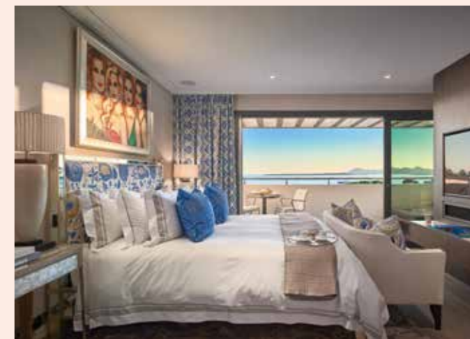
From top: the Mount Nicholson development in Hong Kong; 20 Grosvenor Square's 18-seat cinema; a bedroom in the penthouse at Parc du Cap

reputation is based on a fusion of minimalist Zen design and exceptional service in secluded locations. Aman Tokyo recently broke that mould, and its newest offering in the Beaux-Arts Crown Building on Fifth Avenue is the brand's first foray into city-centre residences. The 22 homes atop the 83-key Aman New York ( aman.com ) hotel have all the gold bells and crystal-glass whistles (not to mention Central Park views) one might expect in an elite urban sanctuary, but again →