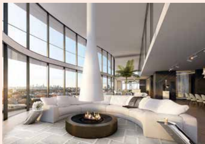
The penthouse lounge in Saint Moritz, Melbourne

St Lucia, split between five beachfront villas and five residences perched in the verdant hills above. With access to the Viceroy hotel's services, including PADI dive centre, award-winning spa, chauffeured vehicles and more, residents also