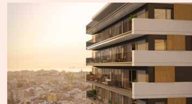
The 15-storey A'Tower in Lisbon's Amoreiras neighbourhood

in 2019. According to realtors Knight Frank, residential prices are still competitive at about a third of comparable London property, with renovated 18th- and 19th-century buildings all the rage. The most sought-after neighbourhoods are Alfama around Sé de Lisboa cathedral, Marvila and Beato, which are fast acquiring a creative