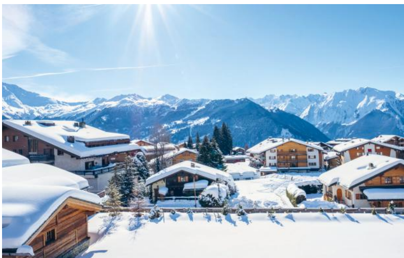
From top: 294 Draw Drive, Aspen, U.S.; Résidence Alex, Verbier, France.