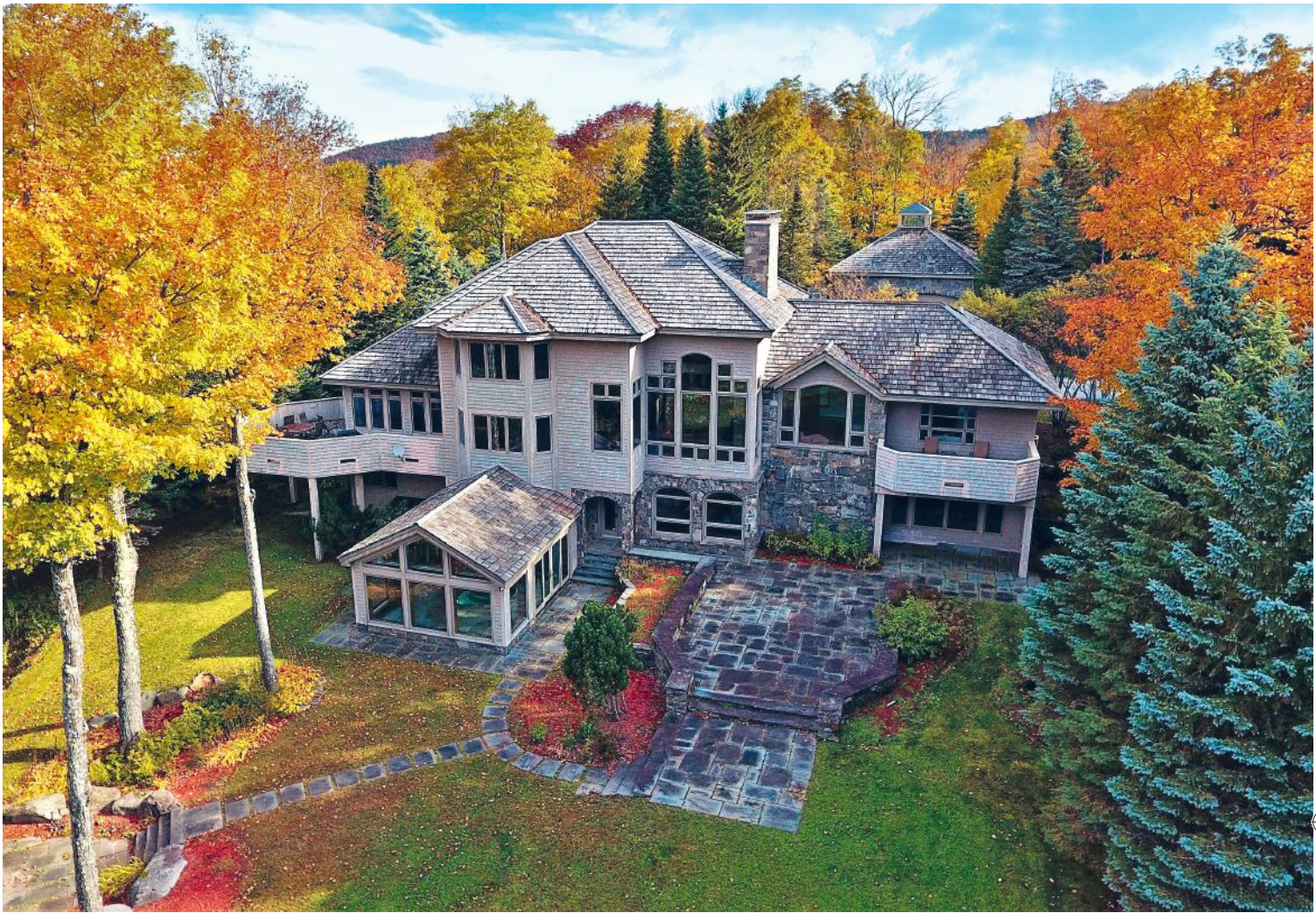
One of the Four Seasons Private Residences, Whistler, Canada.

theatre, wine enclave and large fireplace to warm the cockles after a day on the slopes—the Aspen Mountain Ski Resort is only a short drive away. On a smaller scale, but still substantial enough for a family holiday in winter or summer—when the walking, cycling and horse riding all come into their own—a three-bedroom condo like the one at 900 E DURANT AVENUE ( knightfrank.com ) in downtown Aspen is a low-stress option. High ceilings, open plan, and just a few blocks from the gondola, it would rent in a heartbeat.