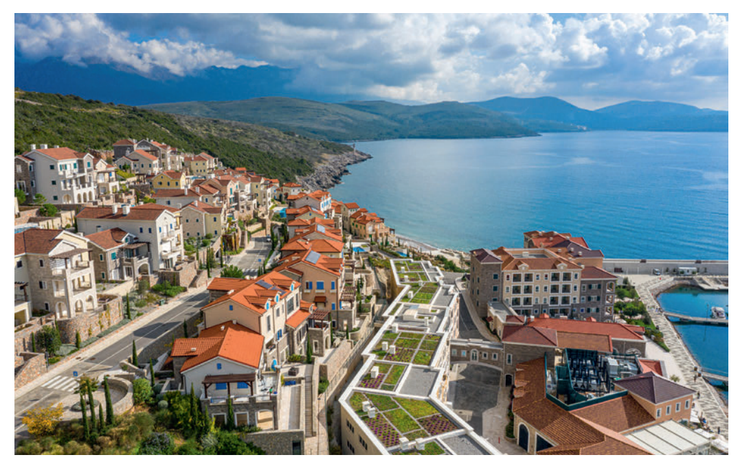
A bird's-eye view of Montenegro's Luštica Bay, along the glittering Adriatic Sea

and tranquillity" as well as access to the resort's impressive range of amenities. Quinta do Lago has also recently acquired the Conrad Algarve, with real-estate plans to be announced soon. quintadolago.com