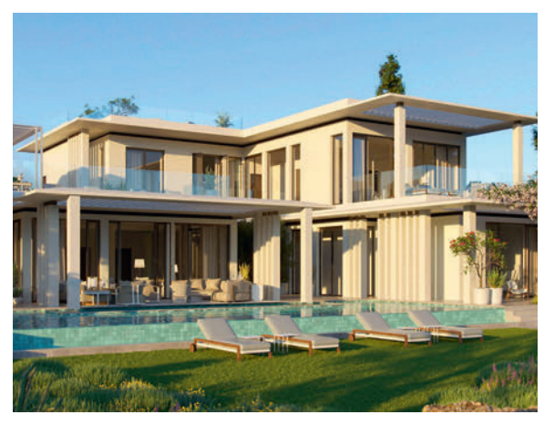
Poolside at Limassol Greens' majestic Falcon Villa

Set on some 570 hectares of the Sologne forest, 90 minutes south of Paris, these three- to sevenbedroom standalone homes will have access to all the