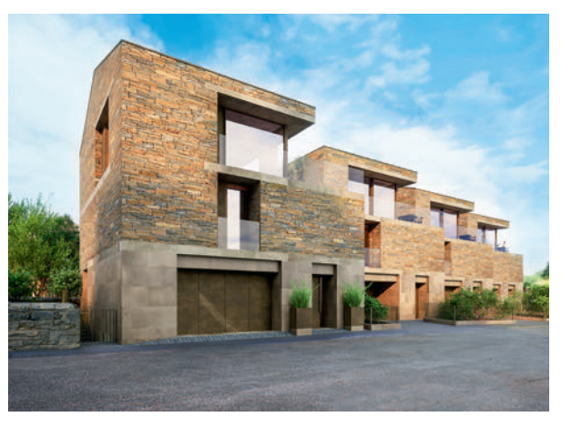
The three-storey Swilcan Townhouse, which overlooks St Andrews' Old Course