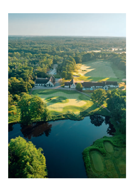
The green – and new Six Senses Residences – at Les Bordes, in the Loire Valley